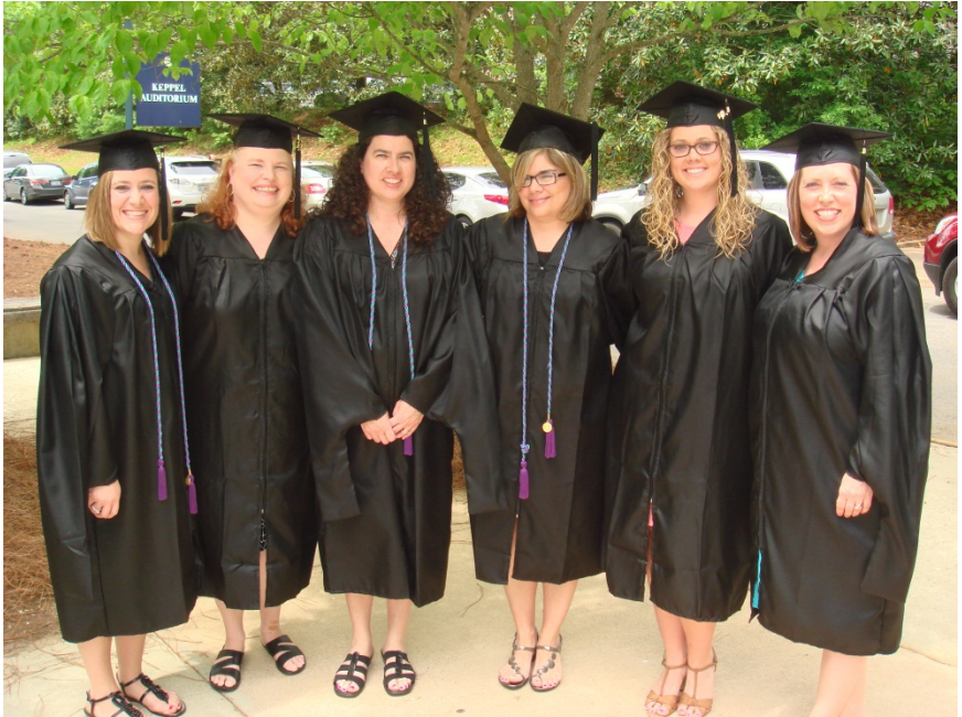
Class of 2013