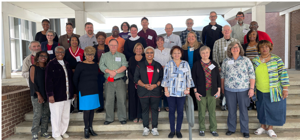
Clergy Days 2021 in person Participants on October 29, 2021

To read about 2021's event please click here .