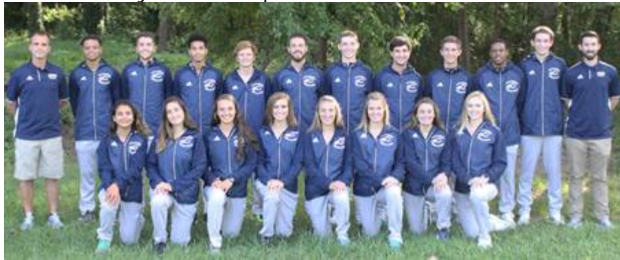
Women's Soccer at Mars Hill