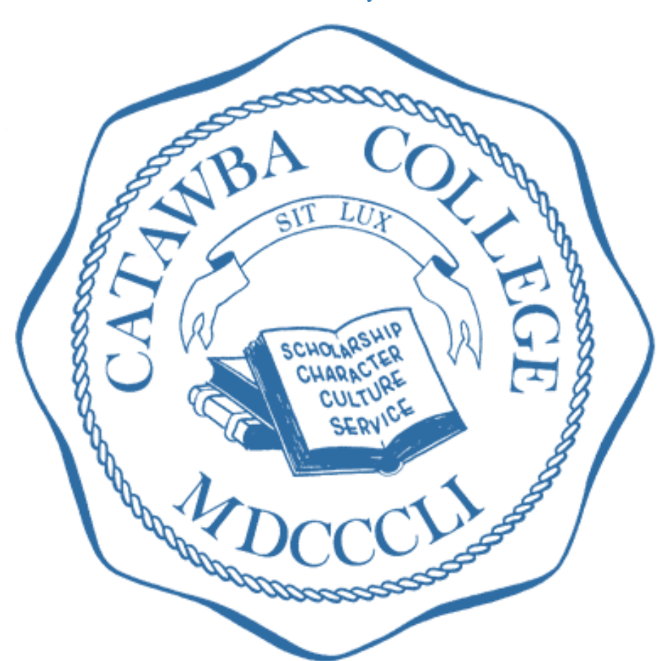
The Mission Statement

Catawba College was founded in Newton, North Carolina, in 1851 by the German Reformed Church. The College--which is today affiliated with the United Church of Christ-- moved to its present location in Salisbury in 1925. The College endeavors to attract students both nationally and internationally of good ability and character. A private, coeducational institution, Catawba offers the Bachelor of Arts, Bachelor of Business Administration, Bachelor of Fine Arts, Bachelor of Science, and Master of Education degrees to traditional and non-traditional students. The College also serves the public through educational outreach and volunteer service programs for the world community.